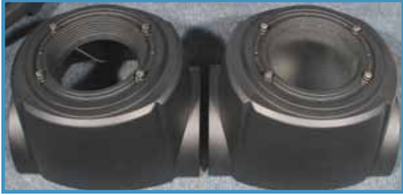
Fig.15: Optional diffuser.