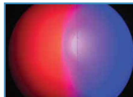
Fig.6: Split colors.

The color wheel has the usual select-and-rotate functionality. It's a fairly quick wheel with optional quick-path operation, not the fastest I've seen, but with pretty good snappy changes. It also has a good range of wheel-rotate speeds. As one of its advertised uses is in stand-alone operation for display and retail work, these slow, subtle changes are important.