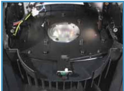
Fig.4: Heat shield diffuser.

Whether discussing large or small units, these reviews always follow the same format. I examine the single sample of the product that's been supplied to me by the manufacturer and measure every parameter on that unit as accurately as I can. These measurements are provided to you without embellishment, so that you have the information to draw your own conclusions. As always, let's start at the lamp and work forward through the smartMAC, ending up at the output lens.