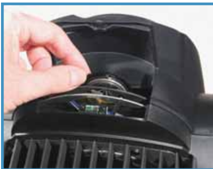
Fig.11: Changing gobo.

One attribute that I found slightly different from other moving lights was the very large gap between gobos that was noticeable when rotating the wheel slowly. One gobo almost completely disappears, leaving a black screen before the next rises into view. You can see when doing this that the actual projected beam width is about twice that of the open aperture, so there's quite a lot of vignetting going on. I'm not sure if this is deliberate on Martin's part—so that it behaves a little like a slide projector—or whether it's just a function of the engineering decisions on wheel sizes. The novel access to the gobo and color-change system pretty much requires that the two wheels are of equal size, so that constraint may have driven this design. I also noticed some focus difference between gobos—this is undoubtedly driven by the mix of materials, with metal gobos focusing differently from glass ones. It's not a big deal, as the smartMAC has remote focus capability, but one should take care when programming.