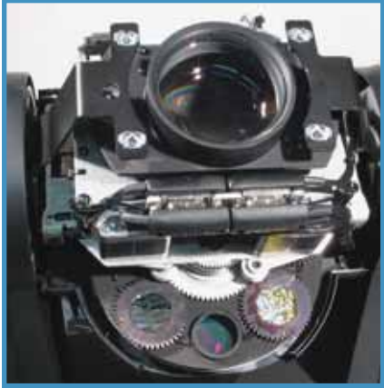
Fig.12: System overview.

about gobo and color replacement. Martin has done a very neat job here by providing a tool-free access hatch. Figure 9 shows you what happens: Lift a small flap on the side of the unit and you get direct access to both wheels. There is a sensor to tell if the hatch has been opened and, if the unit is powered up when you open it, movement will stop so you don't have to chase them round. Even neater, you can use the flap sensor as a control—closing and opening the flap quickly causes the unit to increment through the gobos and colors so, by flapping it up and down a few times, you can get the gobo or color you want to change lined up with the access point. After you've changed out the gobo or color, close the hatch again and the unit will re-home those two wheels. It's a very elegant system.