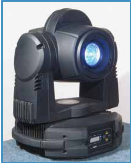
Fig.1: Unit as tested.

We try to cover as broad a range of products as we can in these reviews. We've discussed a number of the largest 1,200W units from various manufacturers over the years, but this month we are going to the opposite end of the spectrum and looking at one of the smallest—the Martin smartMAC.