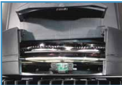
Fig.10: Small fingers required

decision to me, but I guess the Martin marketing moguls decided that it wasn't necessary for the target market. As a strobing shutter it works fine, and provides a measured strobe range of 1.2Hz to 8Hz.