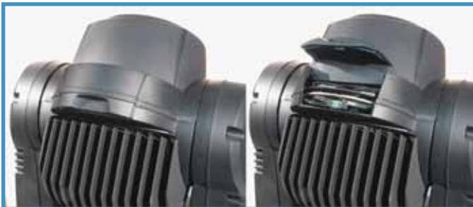
Fig.9: Effects access.

Positioning and indexing accuracy on the rotating gobos was good, with a measured hysteresis error of around 0.26°, which is 1.1" at a 20' throw. Rotation and indexing of gobos was also smooth and clean at all speeds, with no evidence of jerkiness or hesitation. The