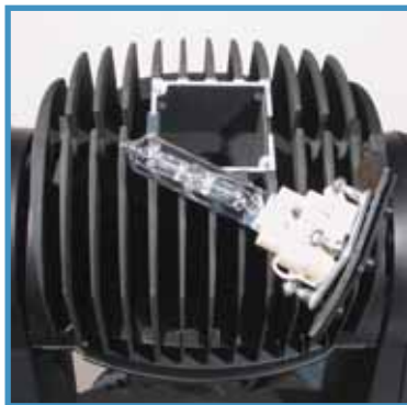
Fig.3: Lamp change.

feature set is obviously more limited than its larger brothers and sisters, and it must be judged with that consideration in the back of one's mind. Having said all that, how does it measure up?