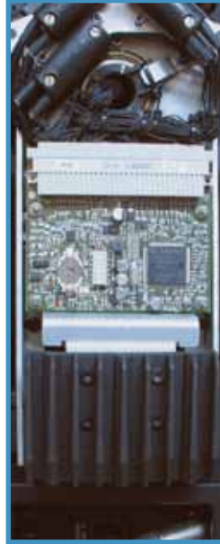
Fig.16: Yoke arm.

In operation, you obviously get some movement noise but it was all extremely low; apart from the homing/initialization noise, the loudest item was the gobo wheel when indexing/spinning at speed, but even that was only 41dBA at 1m.