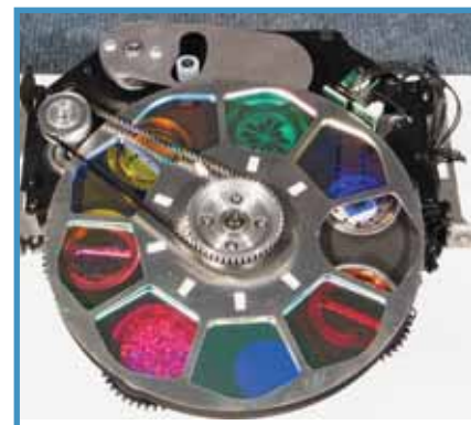
Fig.5: Effects module.

The trapezoidal filters have a fairly small join between them, so the smartMAC can produce some pretty good split colors (Fig. 6). The colors are all removable, and use a center retaining clip similar to those used on other Martin products—the access to change them is much easier than usual, though; more on that later in the review.