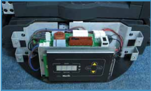
Fig.17: Top box.